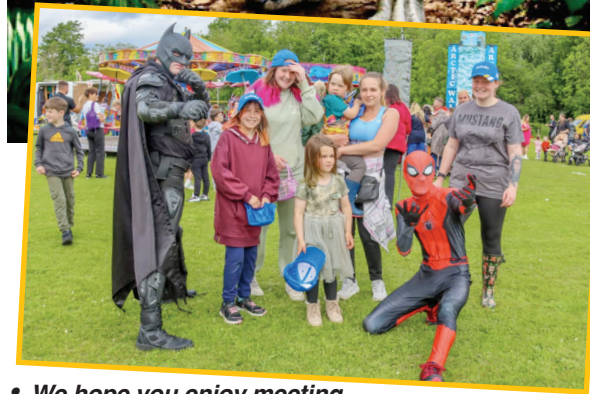
We hope you enjoy meeting Dinosaur, Transformer and Superheroes this year